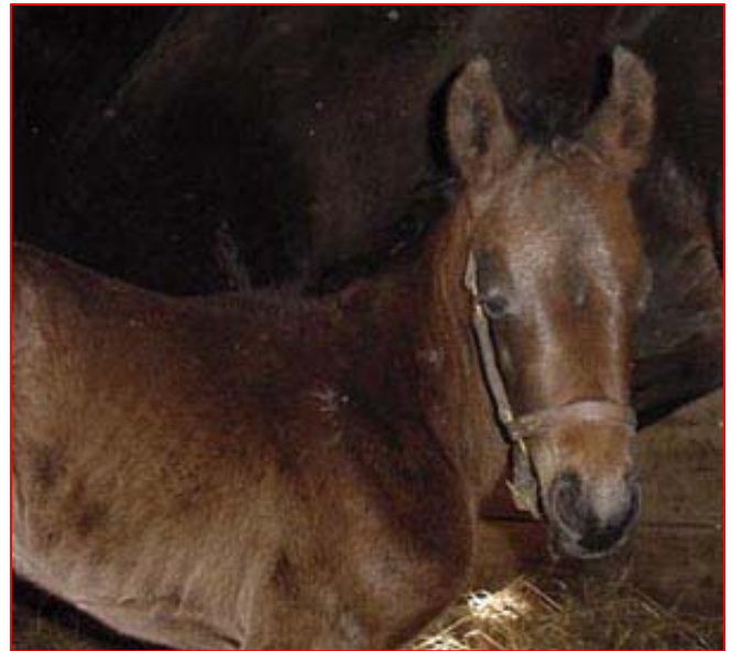
Sailor's Cap, as a foal, had his Rock Hard Ten weanling half-brother sell for $250,000 this month at Keeneland.