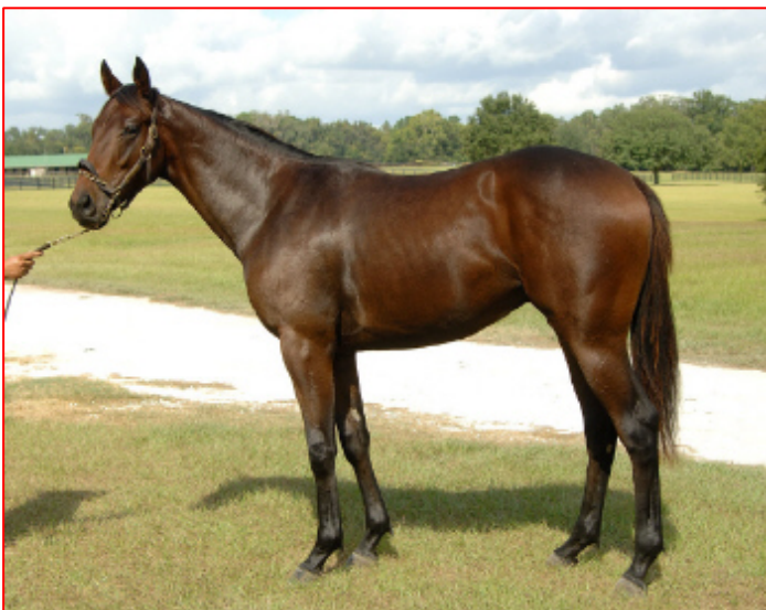
Sailor's Cap as he appeared a year ago training in Florida.