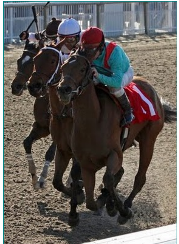
Chantilly Nayla, shown winning the Mardi Gras Stakes at Fair Grounds over the winter, looks like she will not even require a change of colors, as she certainly appears to be draped in Team Valor International's standard issue red and green silks.