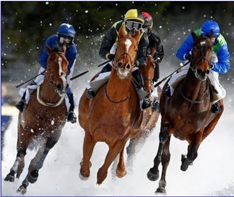
The only surface "Chantilly" has not won over is snow!

Other than that hiccup in her second career outing, Chantilly Nayla has laid the body down in every one of her races, regardless of the distance, the surface or the competition. She has done it all. She has won on dirt, on grass and Polytrack. She has won sprinting and routing. She has won stakes and been Graded placed. She has won from the inside on more than one occasion and she has won while going very wide on other occasions.