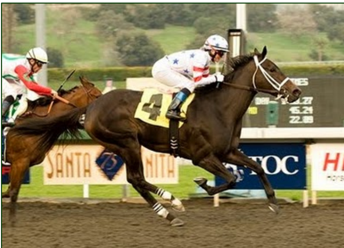
Top of the Charts: the only 3 fillies Chantilly Nayla has been unable to cope with are Champion She Be wild and the pair of Amen Hallelujah and Franny Freud, shown above going 1-2 in the G2 Santa Ynez S. "Amen" is the top ranked 3yo filly in North America and the only 3yo filly with a higher Beyer or Ragozin speed figure better this season than Franny Freud.