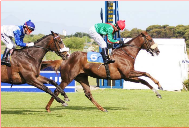
Miller Time provided Team Valor with win number 50 in 2008.

When 4-year-old Miller Time crossed under the wire three-quarters of a length to the good in a handicap race at Arlington Park in South Africa on Friday afternoon, he allowed Team Valor International to achieve a milestone victory number 50, making it the first time that the Kentucky-based racing stable had won as many as half a century of contests in a single season.