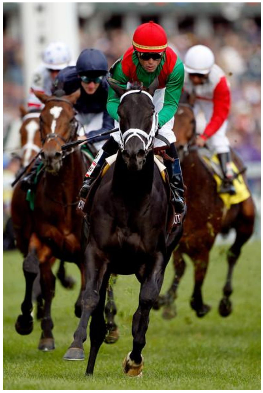
Pluck turned in the performance of the 2010 Breeders' Cup when he was able to overcome one adversity after another to mount a sensational bid in the homestretch after going to his nose at the break in the mile race.