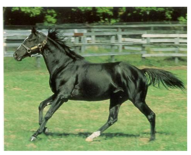
...until they saw him in motion, then they realized that it was the black horse's pure athleticism that made him what he was on the racetracks of North America, where he was Horse of the Year at 3 after taking the Kentucky Derby, Preakness Stakes and the G1 Breeds' Cup Classic in a remarkable crop of racehorses that included his arch rival, Belmont hero and Champion Easy Goer.

"Problem was that Sunday Silence was just a very immature type of horse. Even when he was fully mature, there was not a lot to him physically. What made him great, both as a sire and runner, was his ability to run and pass it on to his offspring.