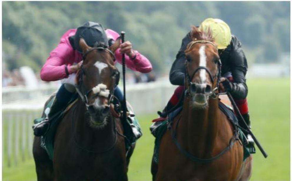
Stradivarius turns back Spanish Mission in the Lonsdale Cup

Spanish Mission firmed from $31 into $15 with Sportsbet immediately after the Lonsdale Cup but his odds tightened further on Saturday morning as Australians awoke to the result, now sitting atop of markets as an $11 outright favourite.