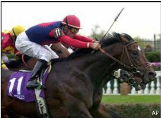
War Chant winning Grade 1 Breeders' Cup Mile.

Red Ransom, like his illustrious sire Roberto, excelled when mated with mares from Northern Dancer's sire line. Danzig and his son Danehill, outside of North America, dominate sire lists, especially in the Southern Hemisphere.