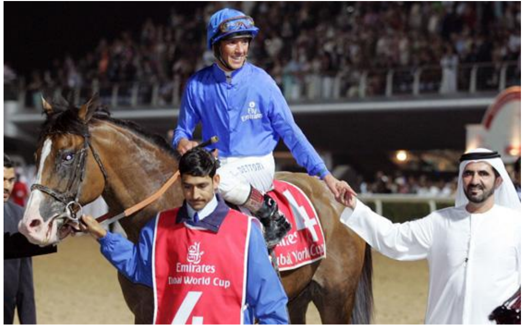
Red Ransom's son Electrocutisionist won World Cup for Dubai ruler Sheik Mohammed.

Red Ransom, who died last year at age 22, sire 97 stakes winners and his daughters so far have produced more than 50 stakes winners. Among his 14 Grade 1 winners Red Ransom counted the likes of Electrocutisionist, who won the Dubai World Cup, Perfect Sting, an Eclipse Award winner on turf in the United States where she won the Breeders' Cup Filly & Mare Turf, and Casual Look, a Lane's End Farm runner that took the Classic English Oaks at Epsom Downs .