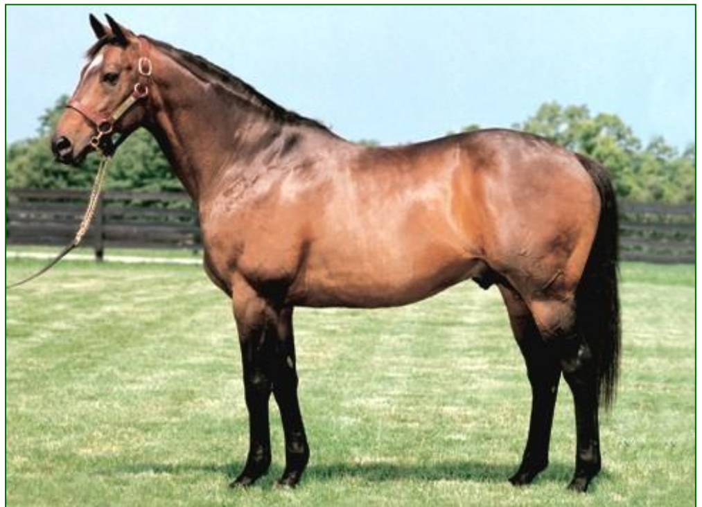
Red Ransom crosses well with sires from the Northern Dancer line such as Danzig. He sired 6 juvenile stakes winners in his first crop standing in Kentucky at The Vinery.

In his first crop, he sired an amazing 6 stakes winners in an era of much smaller foal crops. Topping his first crop was Sri Pekan, whose 5 wins in 6 starts at 2 in England included the Coventry Stakes at Royal Ascot, the Richmond Stakes at Goodwood and the Champagne Stakes at Doncaster.