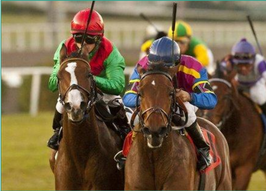
Team Valor International 3yo Summer Soiree nearly joined Claire Marine from 1989 as the only gate-to-wire winners in the Matriarch's 31 editions.