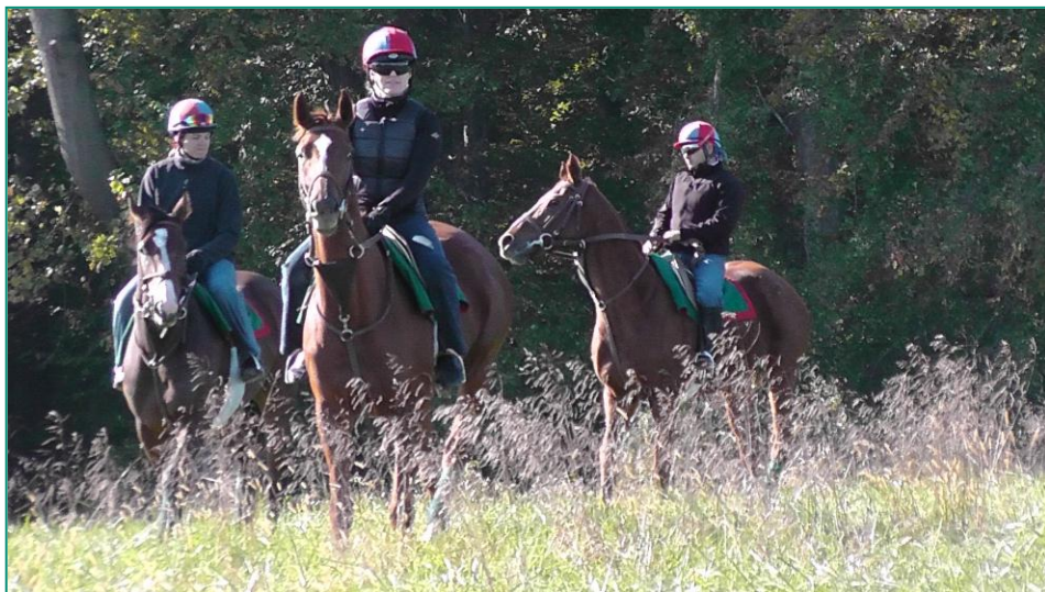
Left to right, Summer Soiree, Master Shade, and Daveron trained together in the field “out back” at Fair Hill last month, prior to Daveron’s sale for $750,000 on November 8.

On the other side of the coin, having the option at a training center to switch a horse from a setting that is troublesome to one where the horse can relax is a positive.