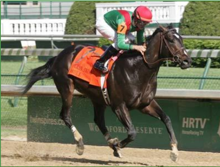
Hull won the Grade 3 Derby Trial Stakes on a loose rein by 4 real gone lengths at Churchill Downs in the manner of a monster in the making, but his career, for all practical purposes, ended right there.

Hull will enter stud next season as the property of a partnership at Stonewall Farm in Ocala, Florida and stand alongside Leroidesanimaux, sire of Kentucky Derby hero Animal Kingdom.