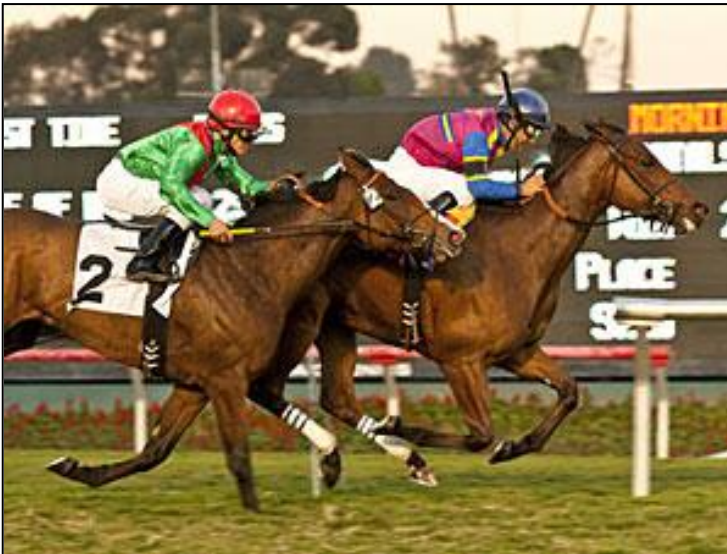
Summer Soiree runs second in the Grade 1 Matriarch Stakes.

Team Valor went $28,196 past the former record established in 2007, when the stable had 45 more starts than the 208 this season.