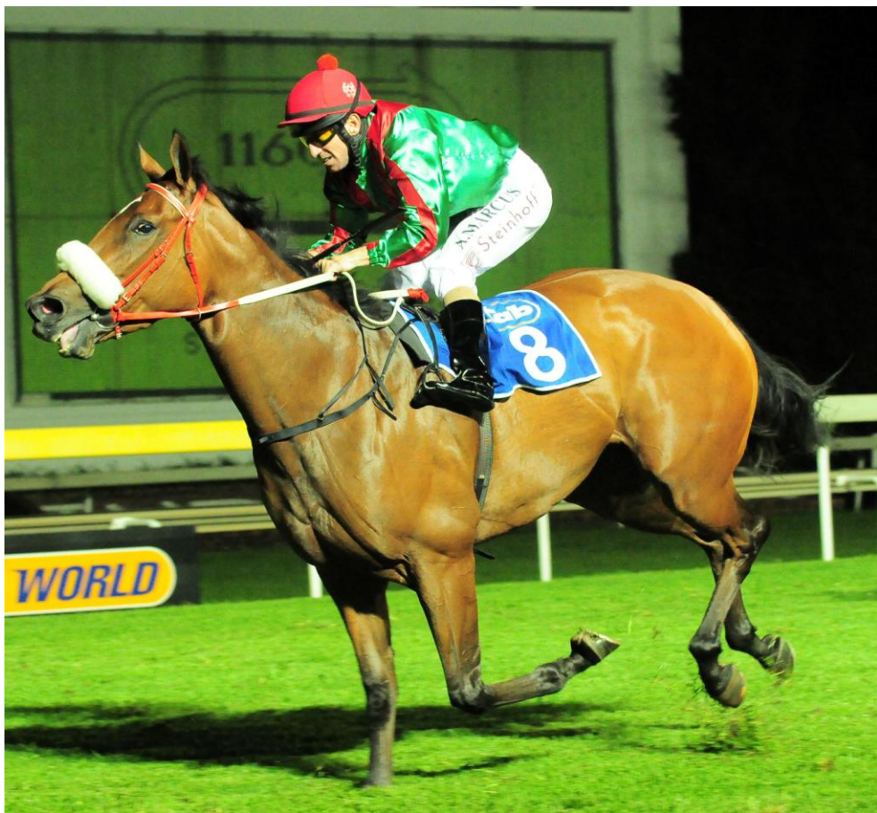
Sting Operation was lonely and being eased as she approached the finishing post of the Listed Swallow Stakes sprinting about 6 furlongs this evening at Turffontein race course in Johannesburg. The unbeaten 3-year-old filly could be Classic bound and might provide Team Valor International with its second Fillies Guineas win of 2011 in the Gauteng version of the fillies mile event run later in the spring on the Highveld.