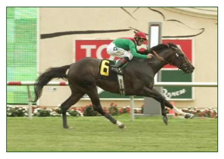
Becrux had a true affinity for the Jimmy Durante Turf Course at Del Mar, where he became a North American stakes winner in the Oceanside Stakes and twice won the Wickerr Handicap.