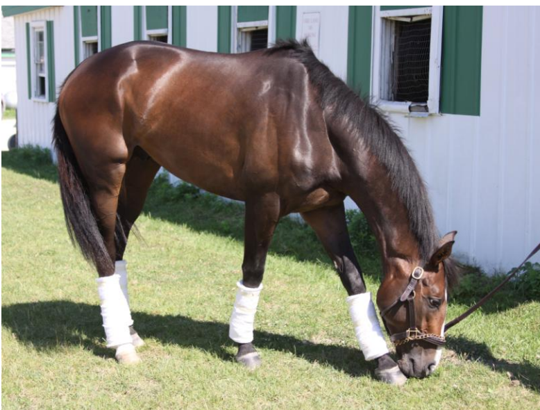
Infinite Magic grazing Saturday morning.

But on Saturday at Arlington, Infinite Magic ($27.20) probably turned in the best performance of his career, taking up an ideal inside spot tracking the moderate pace (24.15 seconds, 49.34) set by Mongolian Saturday. The early leader caved in quickly when challenged by the pace-pressing Dorsett past the three-sixteenths pole, but Dorsett soon found himself swallowed up, too.