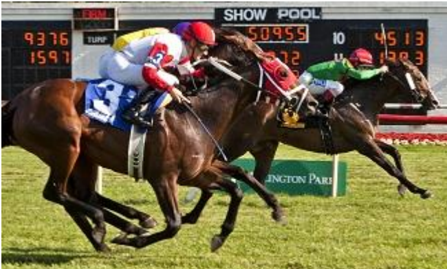
Infinite Magic gamely prevailed in thrilling finish.

Team Valor's Infinite Magic struck the front in deep stretch and produced a head victory in Saturday's Grade 3, $200,000 American Derby at Arlington, narrowly withstanding the bids of Admiral Kitten and Stormy Len in a 3-horse photo. The 3-year-old son of More Than Ready earned his first stakes victory.