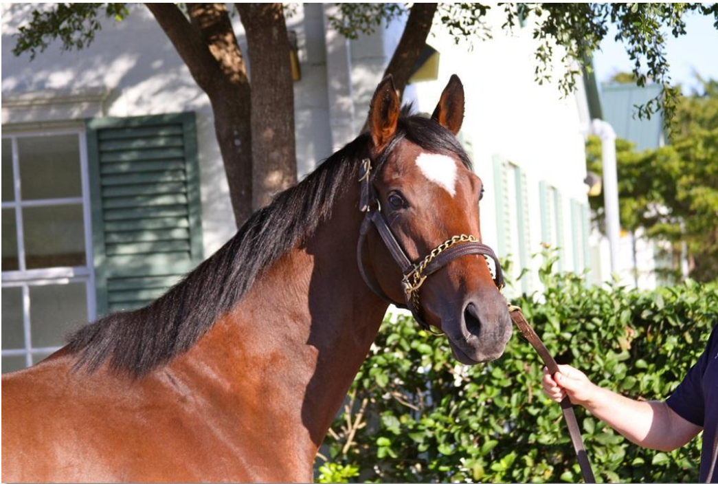
John Velazquez suggested that Went the Day Well is still developing with experience.

Heavy Breathing, trained by Todd Pletcher, started to get weary around the final turn, and Went the Day Well advanced three-wide with eventual runner-up Holiday Promise to his outside and managed to take a short lead at the head of the lane despite his resistance to switch leads.