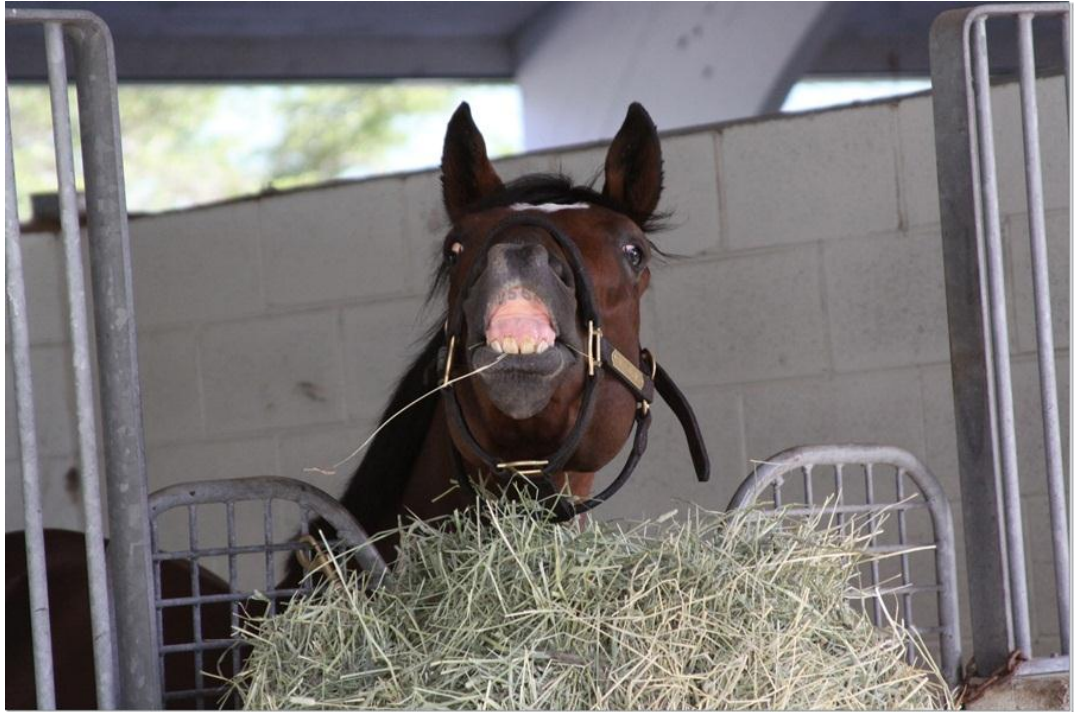
Went the Day Well will train at Keeneland and possibly make one more start there before the Derby.