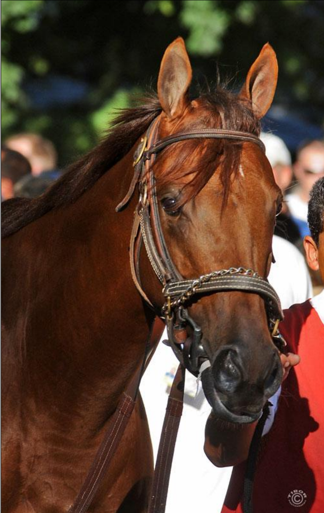
Miss Singhsix developed and matured during her entire career and was a superb looking mare at the end of her racing days. She is odds-on to make a huge impact in breeding.