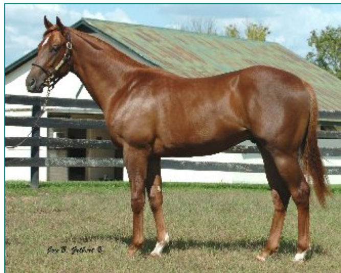
Mr. Greeley imparts size, scope and depth to his foals.

Other runners of note in the United States sired by Mr. Greeley include Del Mar Futurity hero Horse Greeley; Illinois Derby hero Greeley's Galaxy; Grade 1 Humana Distaff hero Celtic Melody; Grade 1 Mother Goose Stakes winner Nonsuch Bay; Grade 1 Belmont Futurity Stakes hero Whywhywhy, also a decent sire; Group 1 Australian winner Miss Kournikova; and Jim Dandy Stakes winner Kensei; American Derby winner Fan Club's Mister.