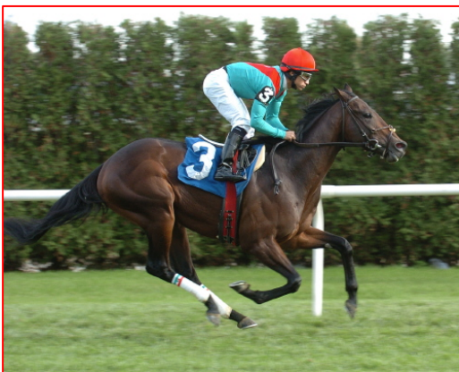
Sailor's Cap won the $600,000 Colonial Turf Cup at Colonial Downs racetrack in Virginia in the summer of his season as a 3-year-old

Initiated two racing seasons ago, the newcomers promotion has to be termed an unqualified success. Two years ago, Team Valor offered newcomers home-bred Sailor's Cap, a colt that went on to win the Grade 2, $600,000 Turf Cup at Colonial Downs at 3 and the Grade 3 Poker Handicap at 4 at Belmont Park.