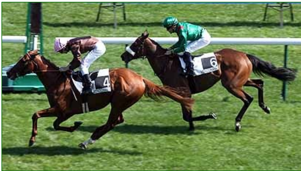
Home-bred 3-year-old Brigantin has finished first or second in 8 of 9 starts at 2 and 3 and recently added the Group 3 Prix de Lutece at Longchamp in France to his cache of wins. He has finished first in 3 stakes races in a row in France and Switzerland.

This season in France, a Team Valor partnership is represented by its star home-bred Brigantin, who may be the best staying French 3-year-old, having finished first or second in 8 of 9 starts, including finishing first in his last 3 starts, all stakes, among them the Group 2 Prix de Lutece last time. He will point for the Group 1 Ascot Gold Cup next June and the $6-million Melbourne Cup the following year.