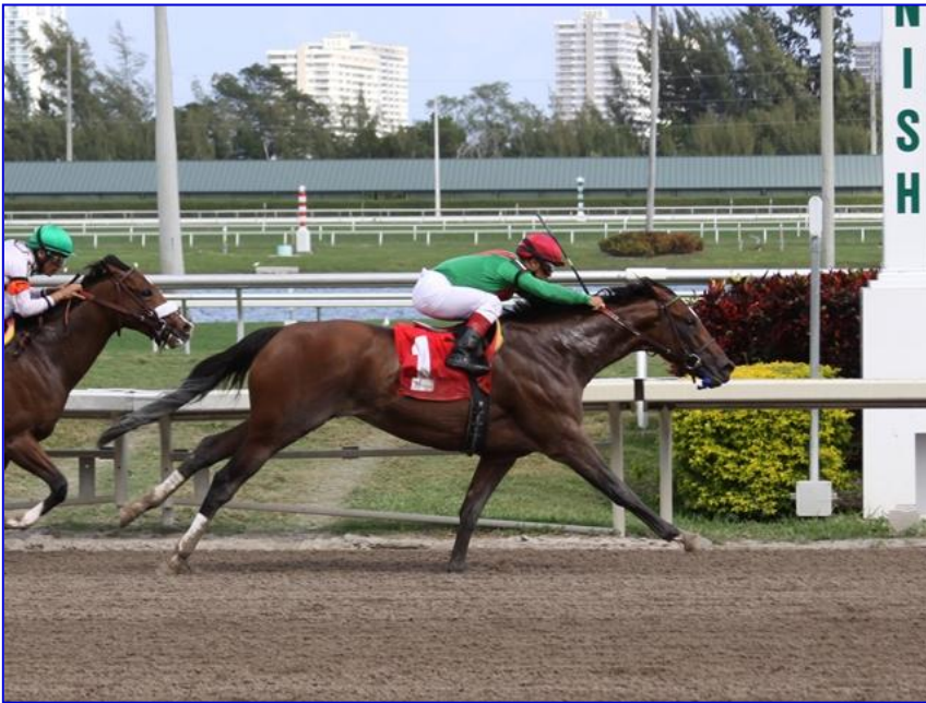
Went The Day Well exhibited a long, ground-eating stride in Florida score.