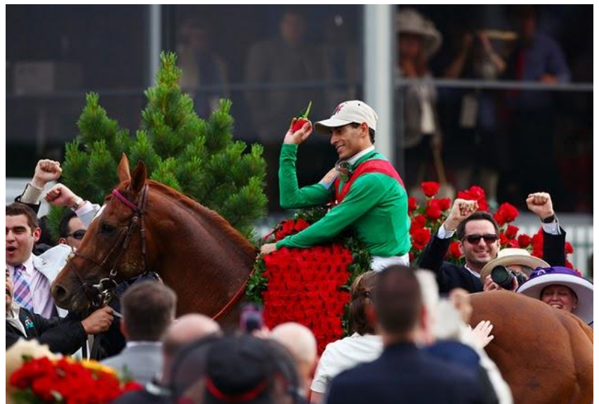
Newly inducted Hall of Fame rider John Velazquez won Derby last year.