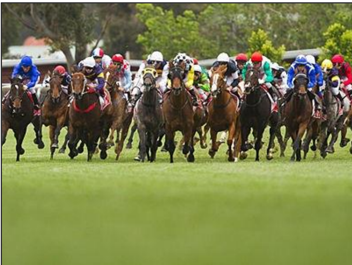
2011: A full field of 24 turns into the home straight for what would be one of the closest finishes in the race's history.