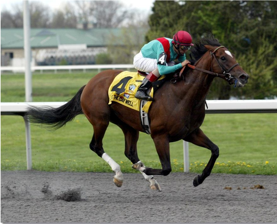
Jockey John Velazquez will pilot Went the Day Well in a final workout on Saturday morning around 8:30 a.m. EDT at Churchill Downs.

that he would stay healthy so we could walk behind him from the backstretch to the paddock, to have that enjoyment and that feeling. When he won, it was euphoric. It was like no other feeling that maybe I've ever had, or at least not in a long time.