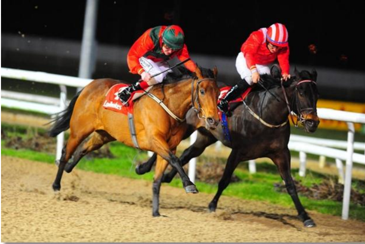
Destiny's Chile came along with late charge to win in Ireland at 3.