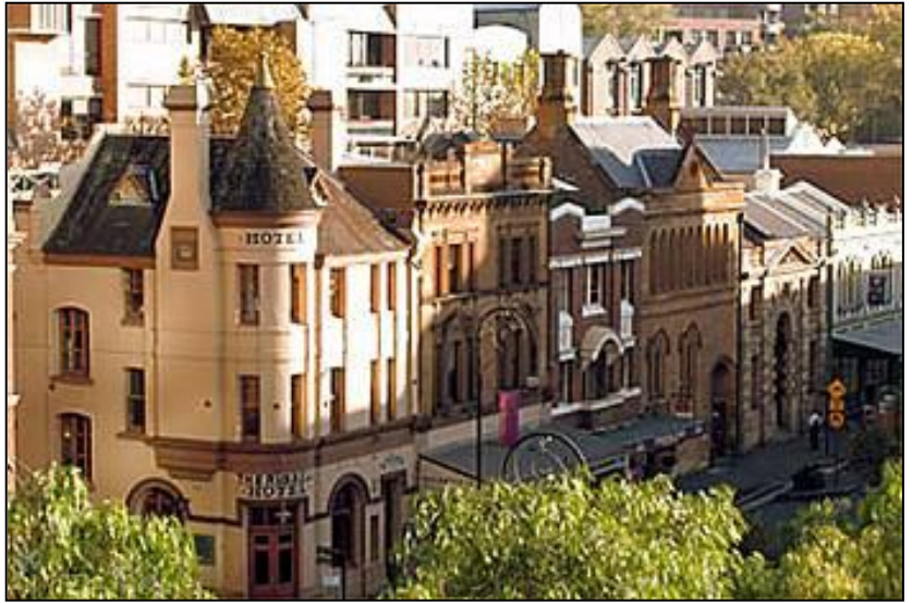
The Rocks (top and bottom) and the bird's eye view (m) of the Sydney Opera House from a deluxe harbour view room at The Four Seasons

Team Valor partners are scheduled to arrive in Australia on Friday, October 26 and met at the Sydney Airport for escort to their residence at The Four Seasons Hotel in the historic district of The Rocks, which will play host to Team Valor's partners for their four nights in Sydney. The harbor side district of The Rocks is well known for vibrant restaurants and shopping along its cobblestone streets, and the area is known for its many treasures including antique stores and galleries for contemporary art, ceramics and sculpture. The Rocks is also home to Sydney's premier street market, open each Saturday and Sunday from 5am to 10pm the northern end of George Street.