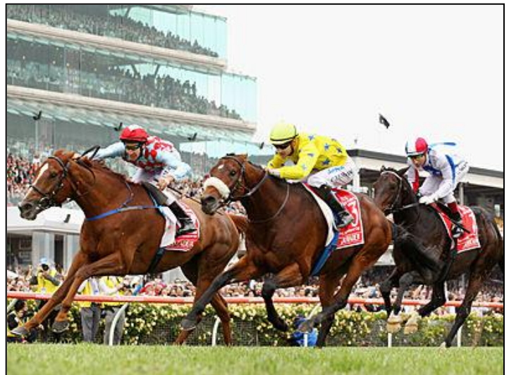
2011: The French-trained bay Dunaden (inside, yellow) prevails by a short nose over English raider Red Cadeaux.

Held on the first Tuesday of November, the Melbourne Cup is the richest handicap in the world and a test of stamina over 3,200 meters. The race is held at Flemington, the nation's best-known and oldest continuing metropolitan racecourse, and is a revered sporting, social and cultural event throughout the country. Popularly dubbed "the race that stops the nation," it is declared a public holiday in the state of Victoria and preceded on Monday by the popular Melbourne Cup Eve Parade. Trainers, owners and jockeys participate in the parade that fills and begins on Swanston Street and culminates in a media conference for the Melbourne Cup runners' connections in Federation Square.