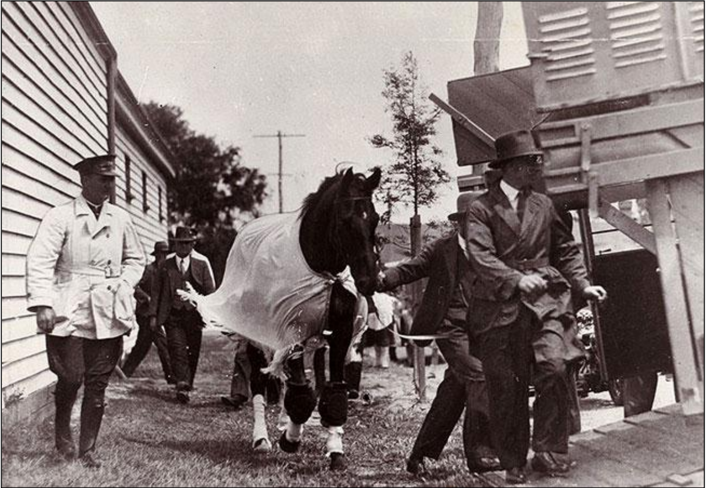
Phar Lap being led by police escort to his van at St. Albans Stud near to be taken to Melbourne for the 1930 Melbourne Cup.

Trip costs for arrival in Sydney on Friday, October 26, and departure from Melbourne on Wednesday, November 7, are estimated to be $7,300 per person for double occupancy. Singles add $2,700 per person for lodging. Quote is based on the exchange rate of US1.04 to AU1.00