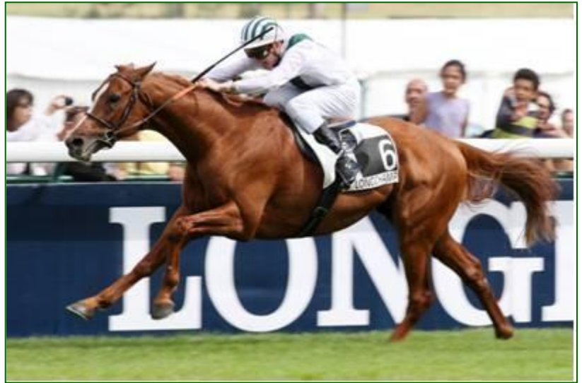
Brigantin stretched for all he was worth to beat Melbourne Cup hero Dunaden for the Group 2 Vicomtesse Vigier last season at Longchamp during a season that saw him place in the Group 1 Ascot Gold Cup and the Group 1 Prix du Cadran. He is back for more this season at 5.