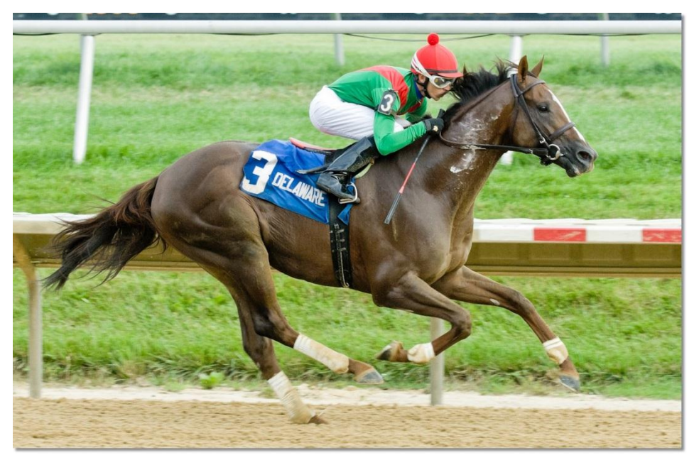
Brujo de Olleros opened up in the stretch to win by more than 6 lengths in the Hanford Memorial over one mile and 70 yards, and both his jockey and exercise rider expressed confidence that he can handle a mile and an eighth.

The real Brujo de Olleros made his presence felt in the United States on August 19 when the Uruguayan champion miler rolled to a 6 1/4-length win in the Carl Hanford Memorial Stakes at Delaware Park.