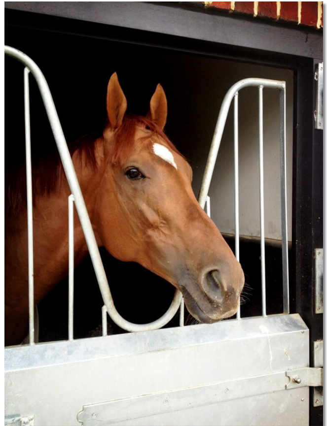
The big boy is bright-eyed and alert in Lambourn, England.