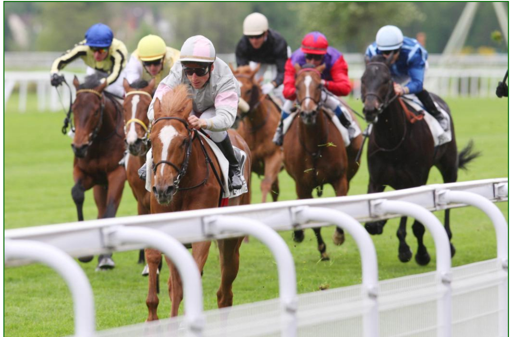
Nisharora readily drew off from her rivals at Maisons-Laffitte in the manner of a good filly.

Nisharora, under special conditions instituted recently by the Breeders' Cup, has been made fully eligible for the program, which Team Valor only discovered yesterday to its delight.