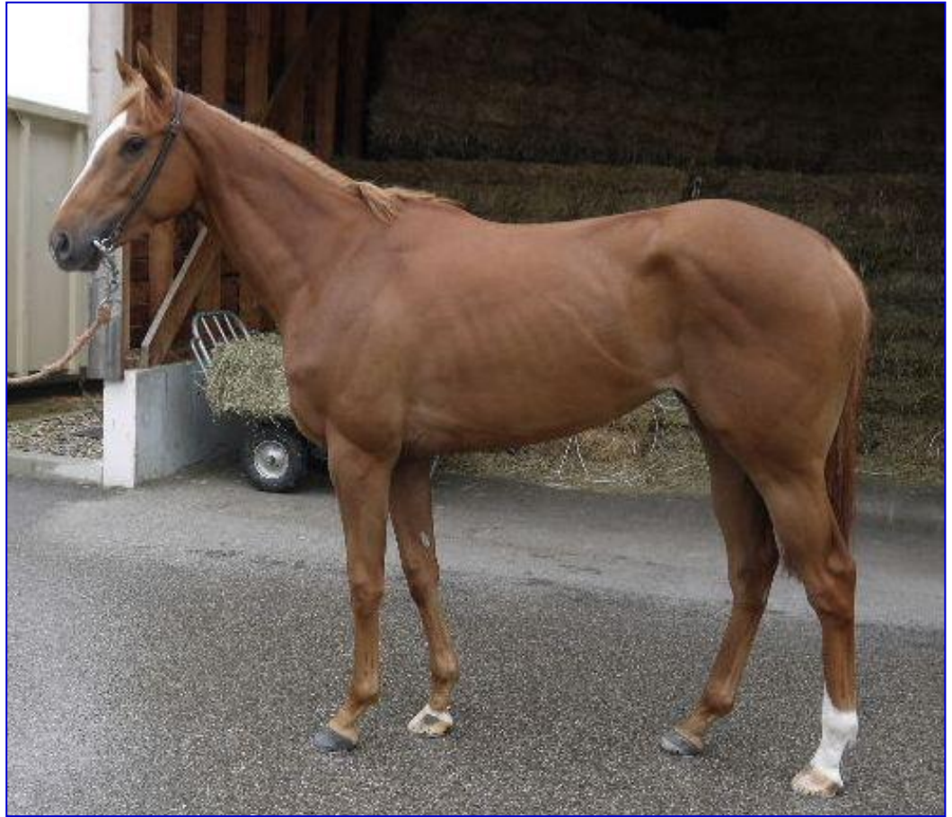
Nisharora is showing brilliance despite physical immaturity. She has a good angle to her shoulder , a perfect pastern angle, a strong neck and good quarters that are not sprint-like.

Nisharora is required to remain in Europe for the next few weeks in order to complete import tests for entry into the United States. So staying around an extra couple of weeks is not an inconvenience.