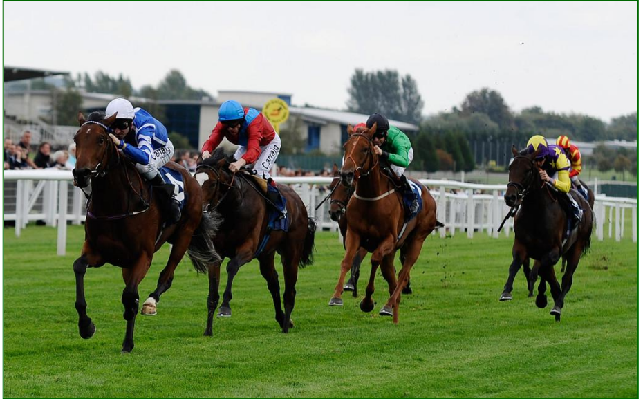
Excellent Art's Hazel Lavery beats older males at 3 in 2012 for G3 St. Simon S.

In his first two crops, Excellent Art has been represented by 7 individual stakes winners, as well as a pair of Central European Champions. One of the 7 stakes winners notched its stakes wins in New Zealand, where Excellent Art shuttled a few seasons ago. Each of the European stakes winners have won their black-type races in England, Ireland or France. Six have won or placed in high quality Group races in Europe. An extremely versatile sire, Excellent Art has had a pair of sprint stakes winners, a pair of stakes winner at a mile and one each over 11 and 12 furlongs.