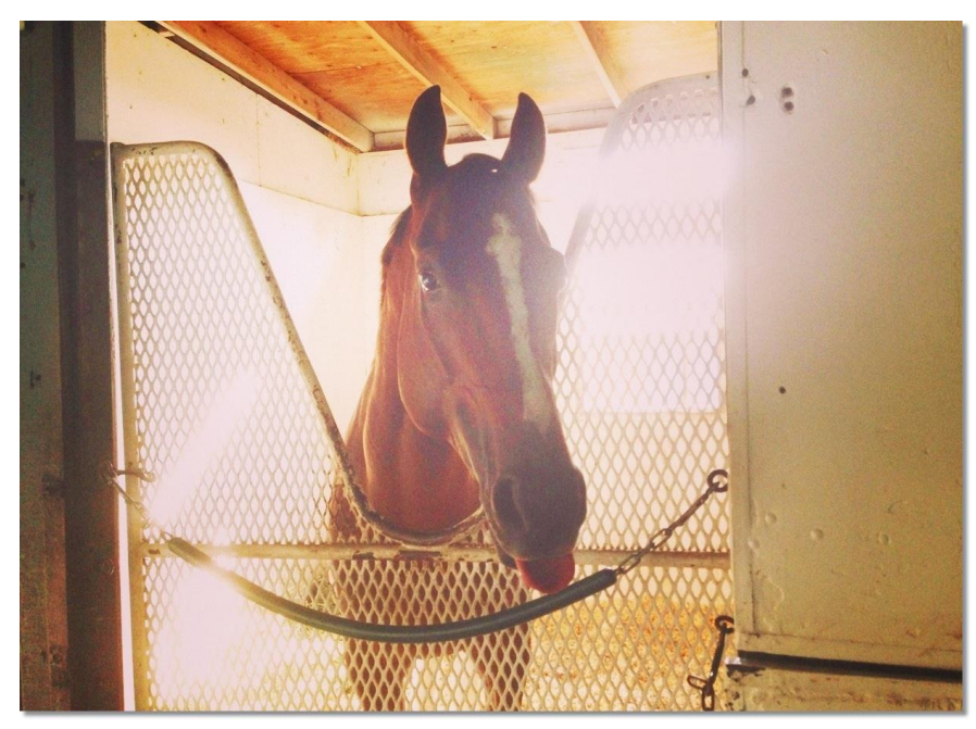
Big ham Brujo de Olleros, looking for a tongue rub.

Brujo de Olleros came out of the race in good shape. He has been shipped to Florida and will not race again until the New Year. He officially turns 6 on January 1, although his real birthdate is August 5 and he is lightly raced with just 11 career starts.